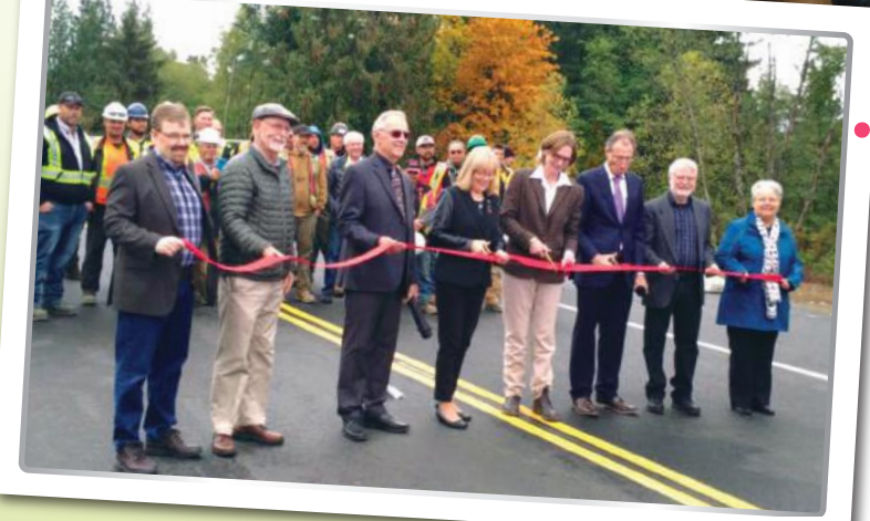
The opening of the North Courtenay Connector with Comox Minister of Transportation and infrastructure Claire Trevena and Regional District representatives.

At North Island College with Minister of Advanced, Skills, and Training, Melanie Mark where students will be benefitting from tuition-free Adult Basic Education.